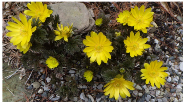
Adonis 'Fukujukai' – the fastest increaser