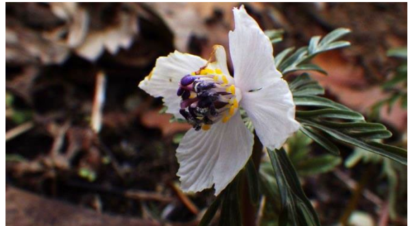
Eranthis pinnatifida flower – blue anthers!!