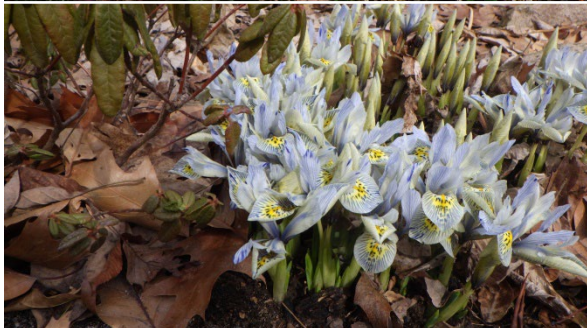
Top Iris 'Eye Catcher' Iris 'Katharine Hodgkin'

Finally, Adonis – you can't have too many, but they are hard to establish, and most are sterile hybrids.