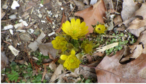
Adonis multiflora – the only fertile species I've been able to establish