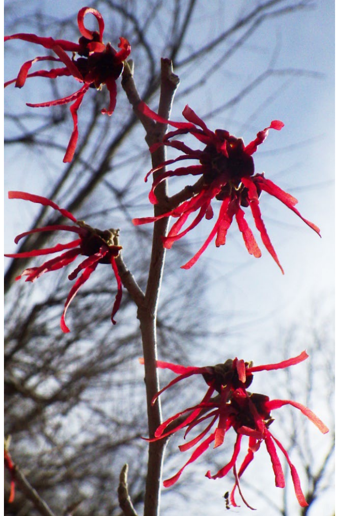
A new Hamamelis planted just last year – Hamamelis japonica 'Tsukubana Kurreani' (‘Shibamichi Red’) A non-fading red flowered cultivar!

Please send address and contact information changes to: