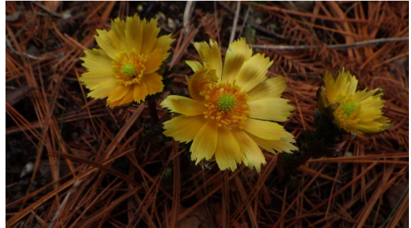
Adonis 'Beni Nadeshiko'

Finally, Adonis – you can't have too many, but they are hard to establish, and most are sterile hybrids.