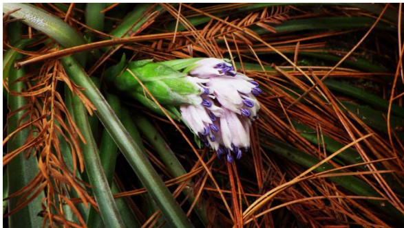
Another "almost out:" Ypsilandra thibetica

The above three pictures are pretty non-traditional March bloomers, but almost always are in bloom by the very end of March.