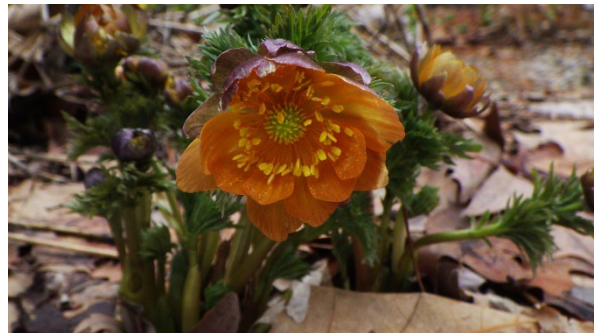
Adonis 'Chichibu beni'