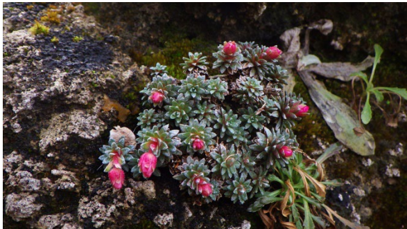
Porophyllum saxifrage almost out