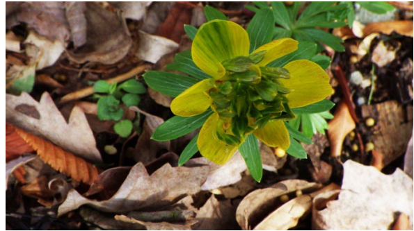
Double Eranthis hyemalis