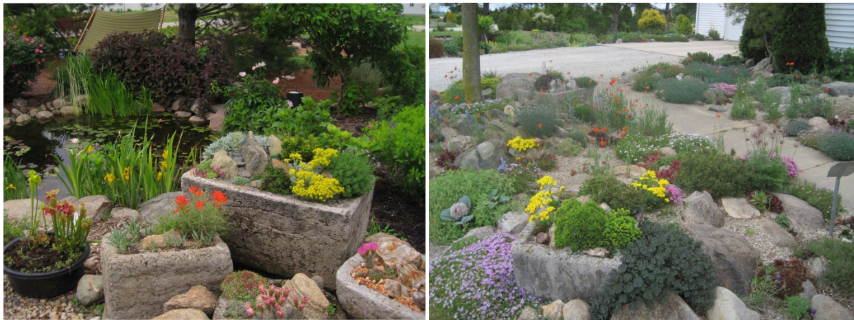
Two views of the beautiful gardens at Benedict's Nursery!

Make your check out to GLC-NARGS, mail to Colleen Mitchell, 3995 Monks Road, Pinckney, MI 48169. In the memo spot on your check please indicate SPRING SALE BUS TRIP.