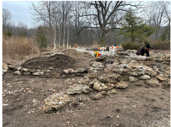
These flat areas without tufa will be a stone 'patio' for displaying troughs

The next steps, besides finishing things, will be planting, which we will begin in the finished areas next spring (after a weeding to make sure