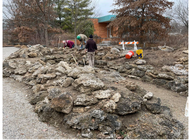
People hard at work Dec. 7 – this is a view of the finished area

Our chapter volunteered to spearhead the rebuilding and pay for the materials (at this point, the cost of the tufa). With the decision to use more tufa, we decided to use a richer soil mix to hold more water so that planting could be primarily on the tufa itself. So we began to hold weekly workdays – and were promptly interrupted by COVID! But we started up again after things stabilized and the gardens opened, and had workdays this summer and fall, organized by Holly Pilon, with Don LaFond taking the lead in rock layout. Our last workday, on Dec. 7th, came very close to wrapping it all up. Here are a few pictures of where it now stands.