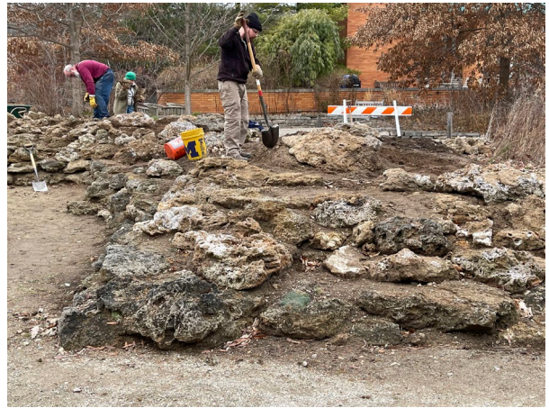
Just about finishing the north side