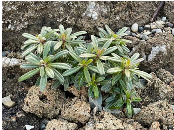
Newly planted Daphne settling in

Daphnes and other newly planted things are off to a good start. And the concept of differing microclimates seems to be working – see the moss below.