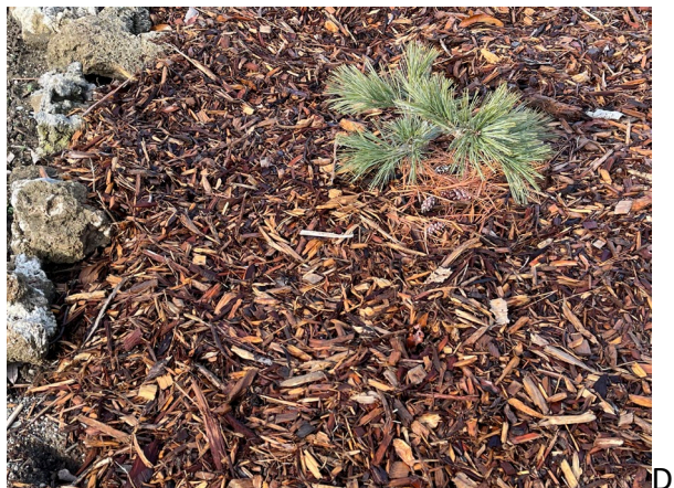
Dwarf white pine – the beginnings of our dwarf conifer display area