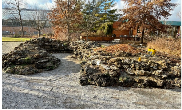
Here is a picture from December. It looks impressive.