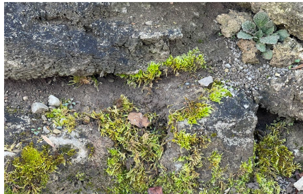
Moss in a moist, shady microclimate

Daphnes and other newly planted things are off to a good start. And the concept of differing microclimates seems to be working – see the moss below.