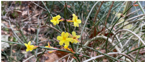
winter jasmine – see next note.

As you all know, from the messages about workdays, our chapter has been rebuilding the Azary Rock Garden at Matthaei. We volunteered to spearhead the rebuilding and pay for the materials (at this point, the cost of the tufa, and some plants). We had a number of workdays this summer and fall, organized by Holly Pilon, and we have kept the garden weeded and got a good start on planting, with some rock garden plants purchased from Benedict's Nursery and Wrightman Alpines, plus generous donations from members. So we're well on the way. We have some dwarf conifers integrated into the garden already, some also planted in the display area on top of the garden, where we'll showcase dwarf forms of conifers native to Michigan (with a few exceptions) and we have obtained a Norman Singer grant from NARGS to purchase rock for a "patio" area that will be used to display troughs. It should be fantastic – and we should finish it in 2024! So make sure you volunteer when called upon. We'll fill people in more at the Winter Potluck meeting.